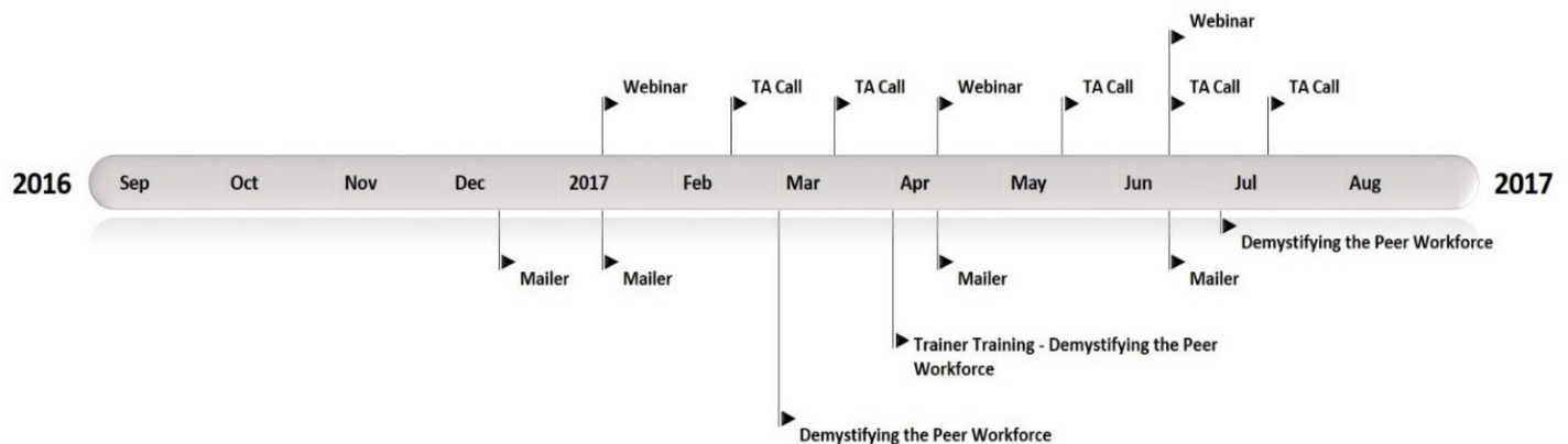
Figure 2: Timeline of Proposed PSI Project Activities

Via Hope originally planned to send four informational mailers, host three webinars, conduct five technical assistance phone calls, facilitate two Demystifying the Peer Workforce trainings, and facilitate one Demystifying the Peer Workforce training for trainers.